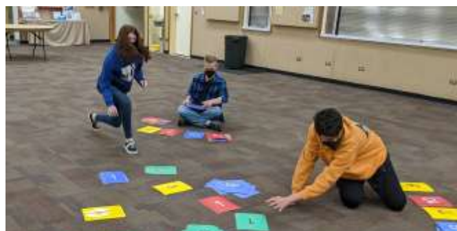
Pictionary and giant card games!