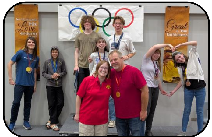
Turkey Olympics Madness

Lunch and VFLD Drop-Off Sunday, December 14, 11:30 a.m. meet in the FLC, lunch at Dairy Queen, drop-off at the Idaho State Veterans Home