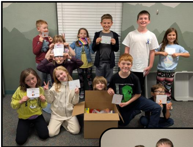
Bible Builders Memories

Christmas Program Performance Sunday, December 14, 11:15 a.m. worship service (please arrive at 11:00 a.m.)