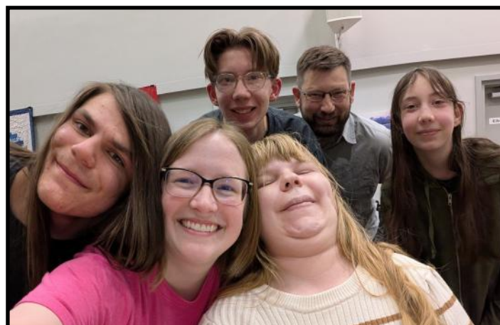
Youth EOY Gathering

Friday, June 26—Monday, July 6 Mescalero, New Mexico