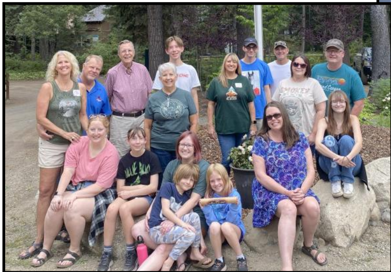
Some All-Church Campers in 2025

"Before I attended all-church camp, I had no idea what I was missing! This special weekend brings together folks of all ages from both of our church services for a mix of glorious rest and joyful fellowship. I will never willingly miss it again!" - a happy all-church camper