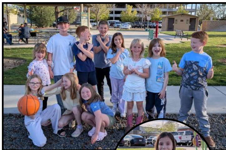
Our Bible Builders kids LOVE an opportunity to play outside!

If you missed our Faith News musical last month—or you're a kid just missing the songs—remember that we post recordings of our church services on our website! It was amazing to watch the kids perform live, and their triumph will remain online for your review for at least several months. Spending time with a far-away grandparent this summer? Consider watching Faith News with them as a fun way to connect them with your school-year church activities!