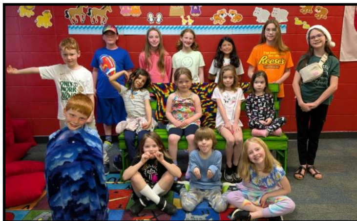
We had 15 kids for Parent's Night Out in April!

Parents' Night Out Friday, May 9 6:00—8:30 p.m., Children's Worship Center Dinner provided; RSVP by May 8