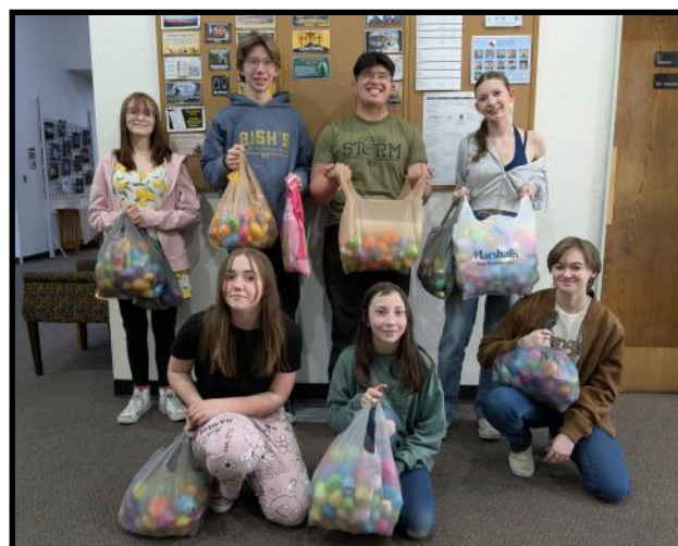
Youth Egg Hunt fun

Tuesday, May 13—Backpack Program 3:30—4:30ish p.m., Meridian Food Bank