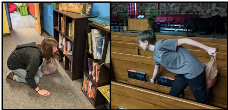
Photos of youth hunting eggs in 2024

Bring a basket or bag to collect your eggs and bring a friend to join in the fun! Please RSVP for this event by Thursday, April 10, so we can be sure to have enough food for everyone.