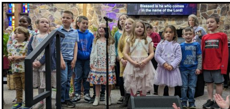
Angels Alive choir singing on Palm Sunday 2024

Palm Sunday – Palm Sunday (April 13) is just around the corner! Here at the Church of the Warm Heart, our children lead us in a Palm parade with live palms at both services! The Angels Alive choir will be singing WITH the Celebration Choir (9:30 a.m.) that morning, too!