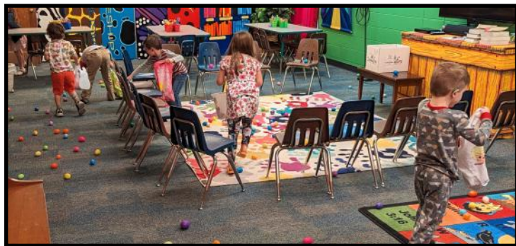
Photo of kids hunting eggs in 2024