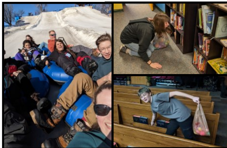
Left: Snow tubing action shot Right: Teens hunting Easter eggs