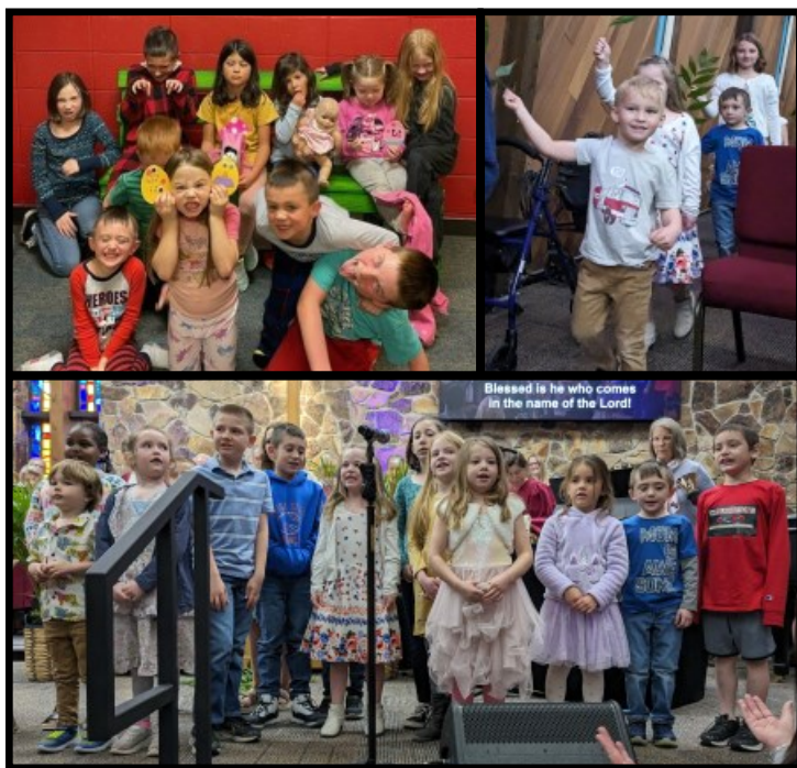
Top left: Parent's Night Out // Top right: Palm Parade Bottom: Performing with the choir