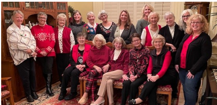
Ladies Christmas Party. Thanks for a great evening!

Our LNO group is hitting the blue and orange court to watch the Broncos take on UNLV! The game is January 24th and tickets are just $10. Please text or email Lisa if you are interested in going so we can reserve the tickets in advance.